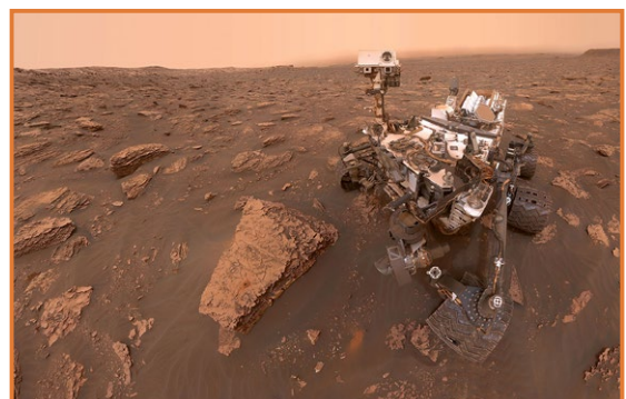
A self-portrait taken by NASA's Curiosity rover.

radiation – Energy emitted by the Sun, some of which is dangerous to humans when not absorbed by the atmosphere of a planet.